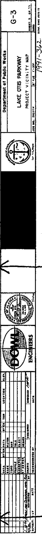
EXHIBIT A - Page 2 of 2